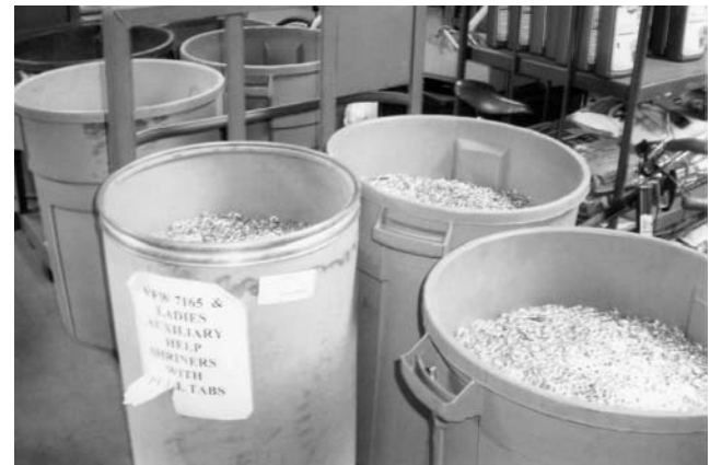
BARRELS OF PULL-TABS processed by the King Philip Shrine Club and ready to be brought to the recycler. By day's end, more than fifteen barrels were collected, which resulting in $800 being raised for the Aleppo Shriners Children's Transportation Fund.