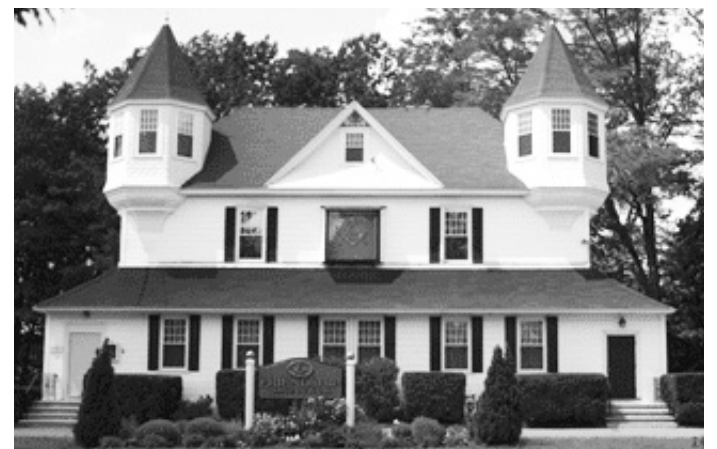
FRIENDSHIP LODGE - WILMINGTON, MA