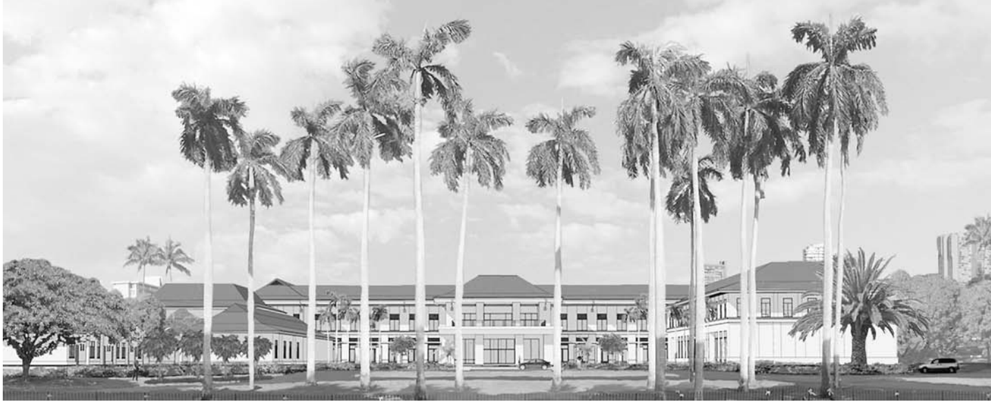
Above is a rendering of the new Honolulu Shriners Hospital, scheduled for completion by June 2010. The hospital will offer the latest medical equipment and services in its specialty fields.

Children up to age 18 with orthopaedic conditions, burns, spinal cord injuries, and cleft lip and palate are eligible for admission and receive all care in a family-centered environment at no charge – regardless of financial need. Shriners Hospitals relies on the generosity of donors to deliver this mission every day.