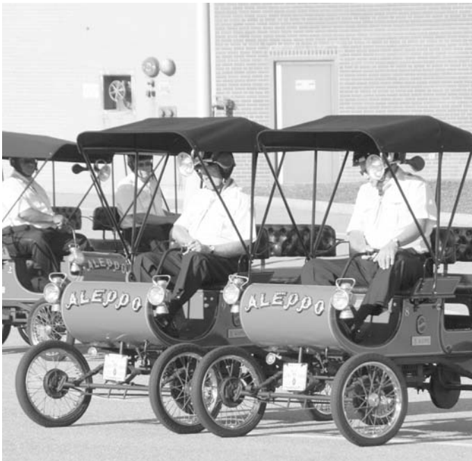
THE MOTOR PATROL AT THE NESA IN MANCHESTER, NH.