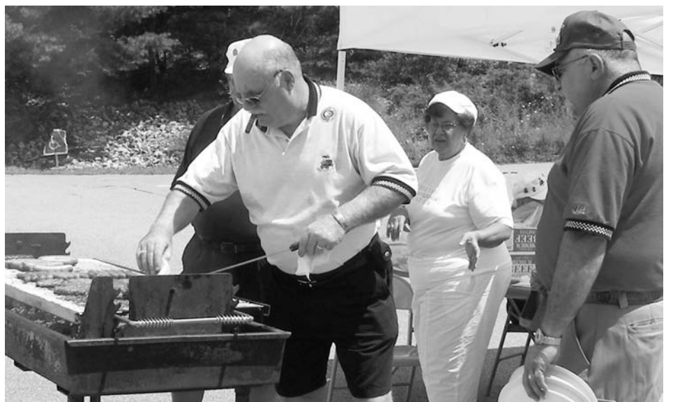
THE LINE IS FORMING quick as the burgers and hot dogs are flying off the grill to feed a lot of hungry people.