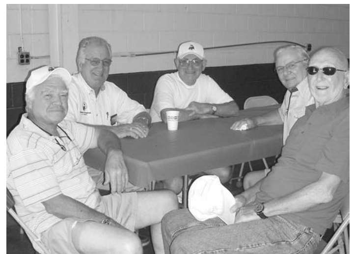
EVERYONE'S WAITING for the kids to arrive to start the festivities.