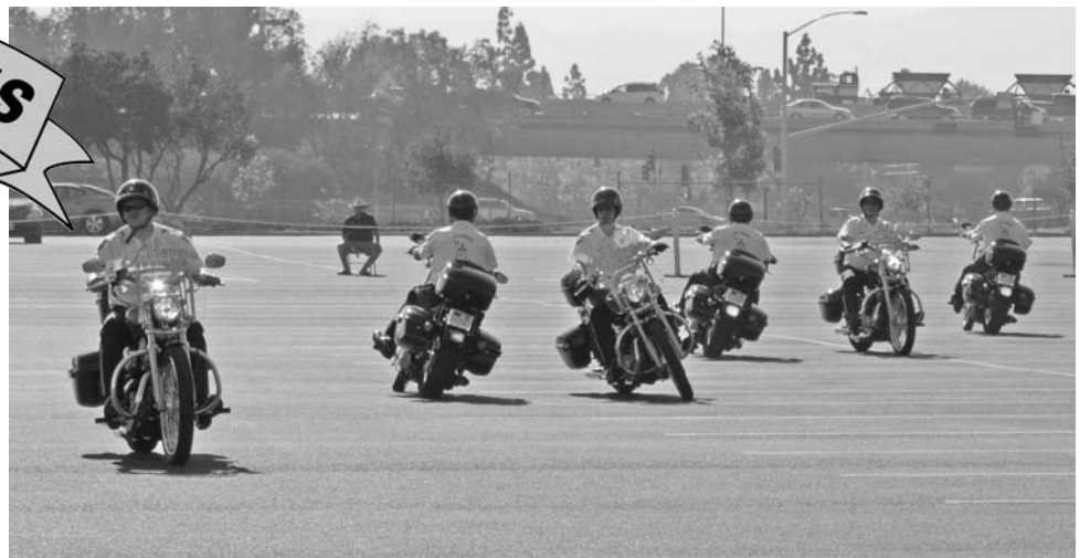
THE CYCLES performing their flawless routine during the International Motor Corps competition at the Imperial Session in Anaheim, California.

Secretary, whose mother passed away during the summer.